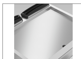
Plate welded to hob, thus guaranteeing a wider cooking zone and preventing the accumulation of dirt.

The plates tilt 10 mm towards the front of the appliance, optimising flow of fat into the drip drawer.